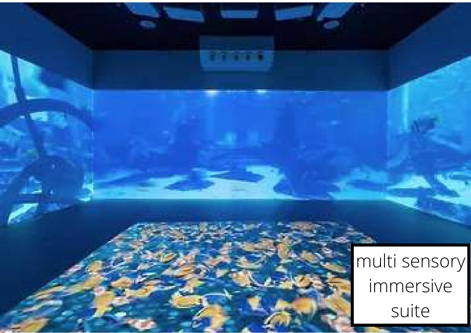
multi sensory immersive suite